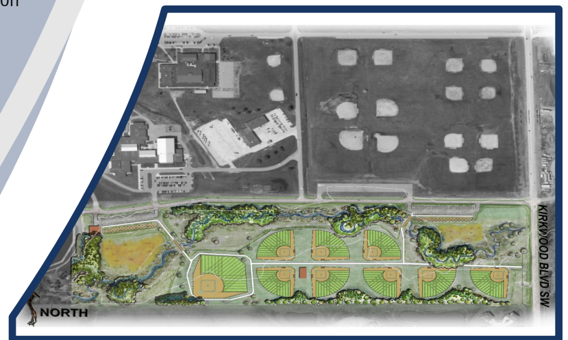
Plantings to provide year-round interest